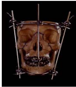
Ext Fixation (OLD)